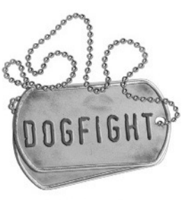
Dogfight, the Musical July 21-29 CenterStage at the JCC